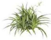
Chlorophytum Spider Plant