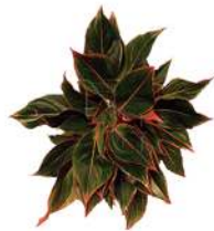
Aglaonema 'Sapphire Suzanne'