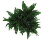
Dracaena Janet Craig Compacta