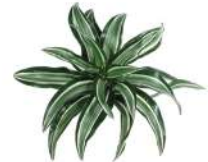
Dracaena Warneckii Jumbo