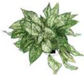
Aglaonema 'Snow White'