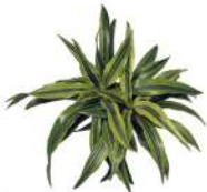
Dracaena Warneckii 'Lemon Lime'